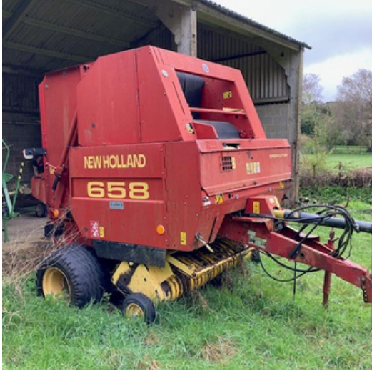
New Holland 658 Baler